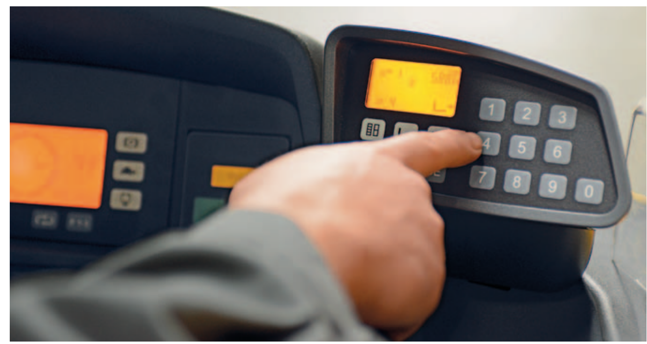
Simple, fast and reliable stacking and retrieval with Position Control.