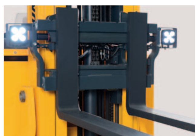
Spotlights on the fork carriage provide best lighting conditions

In dark applications, spotlights on the left and right sides of the fork carriage provide the best visibility, even at high lift heights. The lights are automatically switched on by activating a hydraulic function.