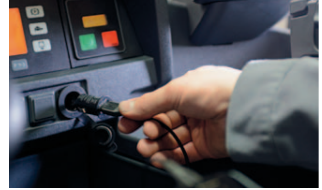
12 V socket in dashboard