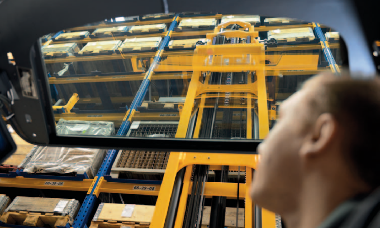
Clear view through panorama roof panel

100% clear view panoramic roof panel Maximum visibility: The panoramic roof panel without the interference of cross beams provides maximum clear visibility of the load and forks.