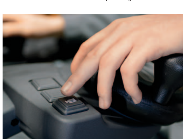
Weight control at the touch of a button

Sensor rollers in the mast and pressure sensors in the hydraulic circuit provide data for calculating the maximum reach speed for the mast. The speed for the mast reach is then maximised depending on the lift