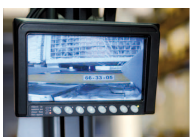
Stacking/retrieval with video monitoring

Warehouse Control is the next stage of expansion to Position Control and is used to connect the truck to the WMS. Consequently, the target height for stacking/retrieval is transferred directly from the WMS to the Position Control function. All the operator has to do is